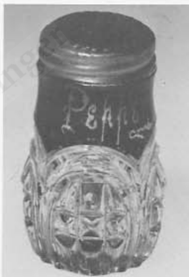
13- INDIANA pattern slat shaker

NOTE: This pattern is rare in ruby-stained. Indiana Tumbler & Goblet Co., Greentown, Ind., used the name INDIANA for the pattern known today as CORD DRAPERY.