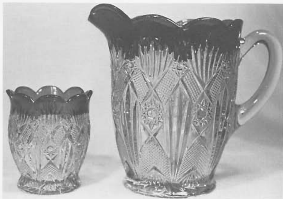
14- INNA pattern spooner and water pitcher