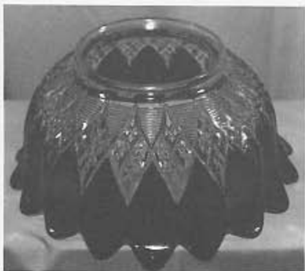
12- IMPERIAL NO. 47 pattern gas shade