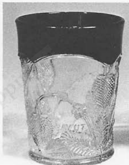
16—Two different views of INVERTED STRAWBERRY (Variant) tumbler with embossed mark "8 AV. OZ."