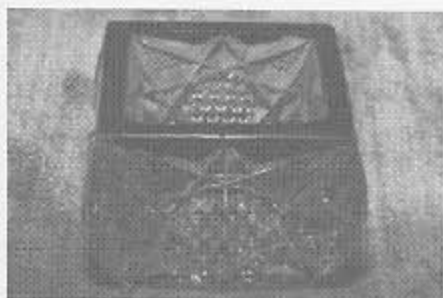
11- ILLINOIS pattern individual open salt