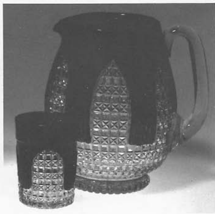
O13-O14—ORION tumbler and pitcher, sometimes called CATHEDRAL