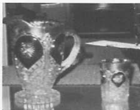
O17-O19—ORNATE STAR pitcher and tumbler