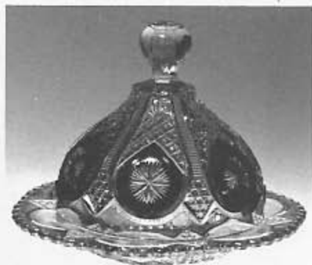
O15—ORNATE STAR covered butter

effect, and it is massive and brilliant. It is made in plain crystal, with an engraving, and also treated in gold. All three show up in splendid style and each will have its respective admirers. This line is also decorated in ruby and gold, which gives it an attractive appearance. This is their heavy line, the other being the Windsor [probably ORNATE STAR , introduced that year], which, though not as heavy in texture, is very brilliant, and as a medium priced line is a beauty. This is also treated in gold and in gold and ruby decorations, for which this factory is famous.