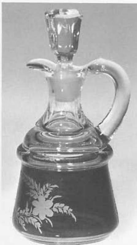
04—Rare ruby-stained OHIO pattern cruet (original stopper)

MFR: U. S. Glass Company state pattern YOP: Introduced in 1896; in 1909 catalogue NAME: OMN OMN: No. 15050 pattern REF: H5 , p. 149 (CATA) K5 , p. 33 LVG , pl. 37 and pp. 104, 105