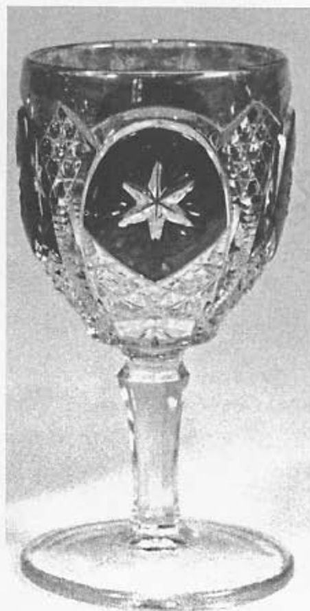
O16—ORNATE STAR wine glass