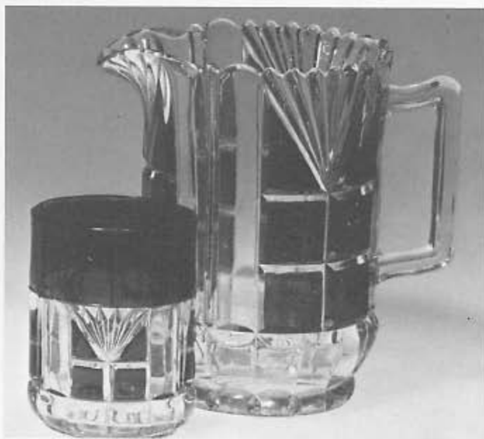
08-09—Richard & Hartley's OREGON pattern tumbler and pitcher. A state pattern which USG also named OREGON later is not known in ruby-stain

FIG: 192-196 MFR: Richards & Hartley Glass Co., Tarentum, continued by U.S. Glass Company after 1891