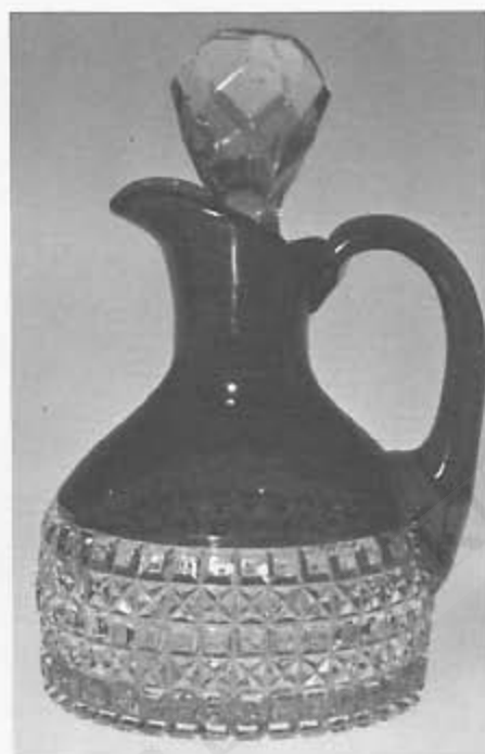
O12—ORION (CATHEDRAL) cruet with original stopper

(CATHEDRAL) FIG: 53-61 (Page 27) MFR: Bryce Bros., Pittsburgh, with production continued by U.S. Glass after 1891 YOP: Circa 1890 to circa 1892 OMN: ORION NAME: K1, p. 19 AKA: WAFFLE AND FINE CUT ( K2, p. 99 )