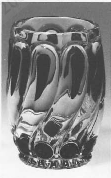
O20—OVAL LOOP spooner

OMN: No. 55 pattern AKA: QUESTION MARK ( Md1 , pl. 14) REF: Revi , p. 286 (CATA) K4 , p. 135 Metz1 , p. 208 Lucas , pp. 234-236 H5 , p. 114 (1891-2 CATA)