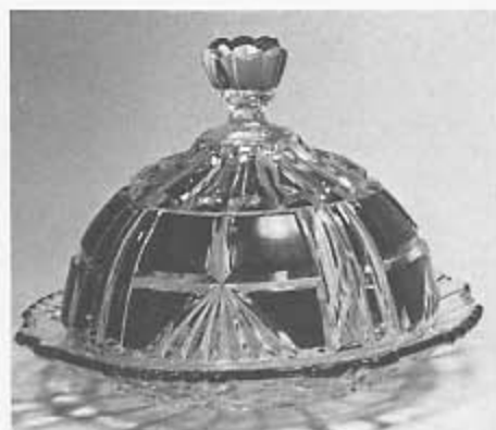
O10—Richards & Hartley OREGON covered butter

NOTE: U.S. Glass reportedly produced a state pattern called OREGON later, which would be very rare if found in ruby-stain. This pattern frequently confused for the similar PLUME AND BLOCK and BLOCK AND FAN patterns, also from the same factory at about the same time.