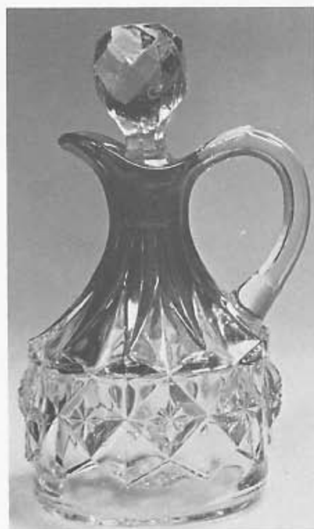
03—O'HARA DIAMOND cruet without original stopper