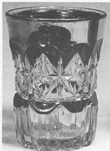
07—OLD GLORY tumbler in red with gold. This is also known as MIRROR STAR

MFR: New Martinsville Glass YOP: Introduced in 1913 NAME: NMG1 , pp. 22, 31 AKA: MIRROR STAR ( K4 , p. 138) OMN: No. 719 pattern REF: PGP1 , p. 22 BB , 3/1916 (set)