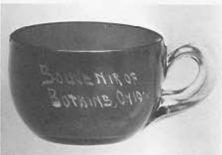
05—OKAY pattern cup with "snowflake" design found in the base of each plain piece

MFR: Indiana Glass Co., Dunkirk, Ind. YOP: Introduced in 1907 NAME: OMN ( PetPat , pp. 124-125) OMN: OKAY AKA: SNOWFLAKE BASE ( K5 , p. 149) REF: Bond , pp. 64-65 NOTE: Souvenired punch cup shown, probably decorated by an independent on Indiana Glass Co. blank