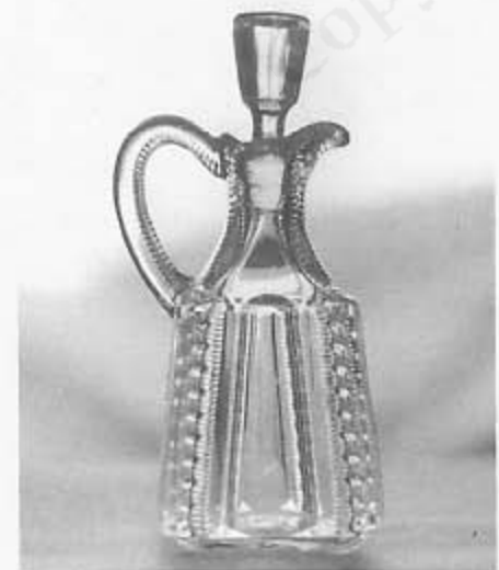
O11—ORINDA clear cruet which would be rare in r.s.

MFR: National Glass at their McKee & Bros. factory YOP: Circa 1901 NAME: OMN OMN: National's No. 14/92 REF: K5, pl. 5 (AD) H1, Fig. 217 (r.s. toothpick)