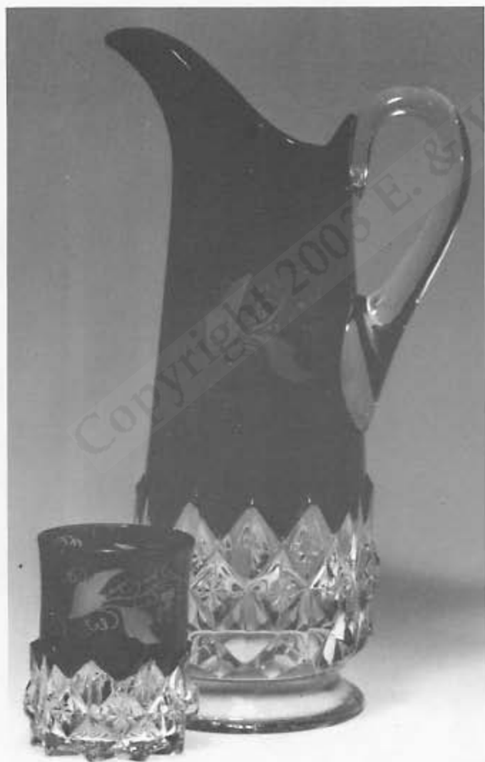
01-02—O'HARA DIAMOND tumbler and tankard pitcher

NOTE: Technically this should be called U.S. Diamond, since the number is the first assigned by the newly organized company. However, since the pattern has long been known by this name, and as the line was probably conceived and designed by the O'Hara staffers prior to the merger, no attempt will be made here to remain historically rigid.