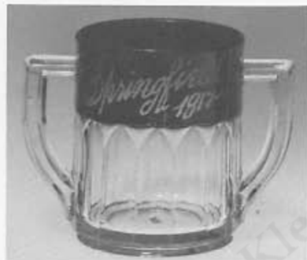
06—New Martinsville's OLD COLONY pattern spooner. The NMG catalogue reprint will be found in Book 8

FIG: 599 (Page 50) MFR: New Martinsville Glass Mfg. Co., New Martinsville, WV YOP: Circa 1906-1918 NAME: NMG1 , p. 24 OMN: No. 97 pattern REF: See Catalogue reprint this book NOTE: McKee-Jeannette also introduced an OLD COLONY pattern (known today as FERN GARLAND or COLONIAL WITH GARLAND) in 1905, so the factory name should be used for both. The McKee line is reported but unconfirmed in ruby-stained.