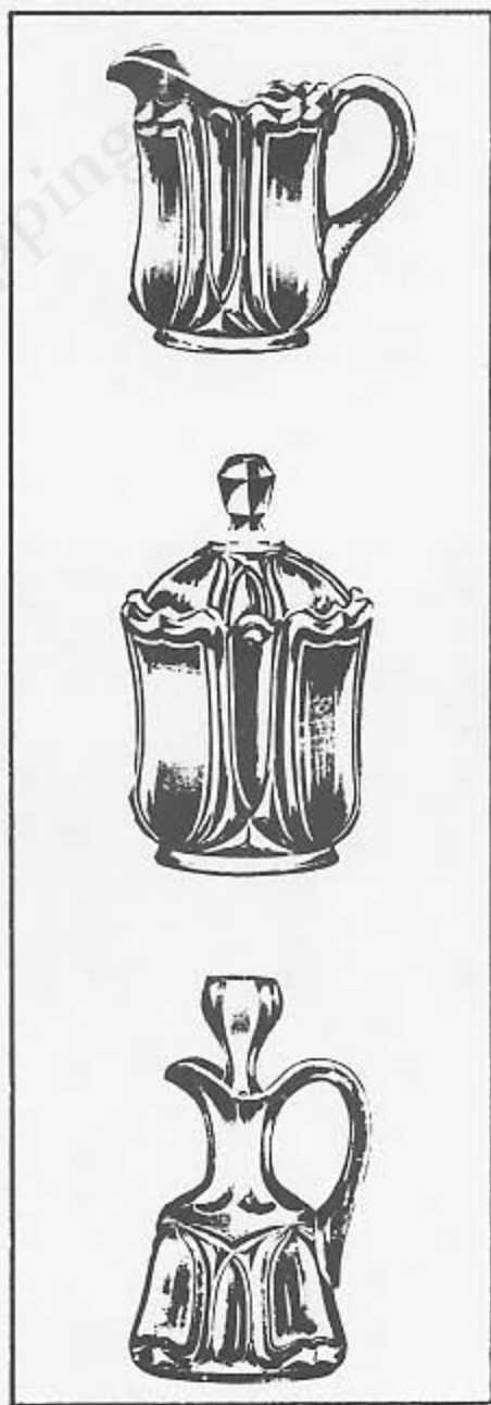
Q2-Q4—Heisey's QUEEN ANNE creamer, sugar and cruet from circa 1908 company catalogue