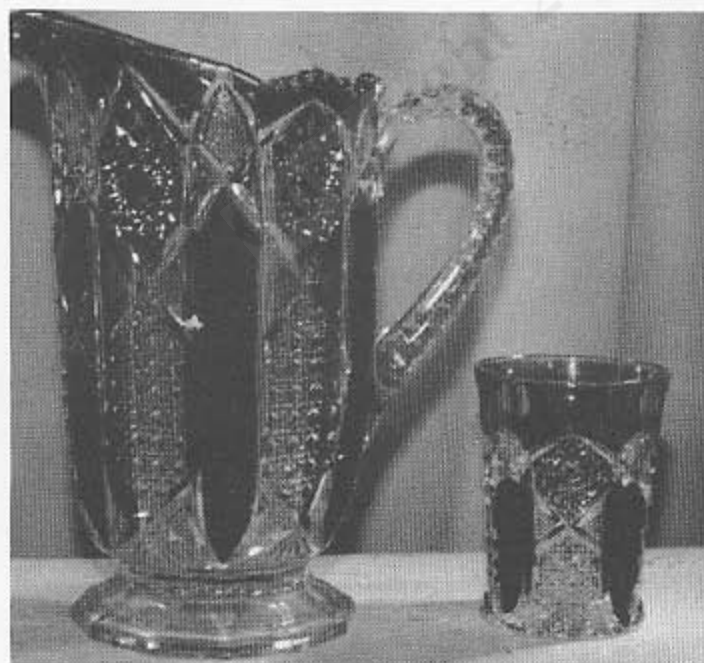
Q5—QUINTEC pattern pitcher and tumbler in ruby-stain with gold