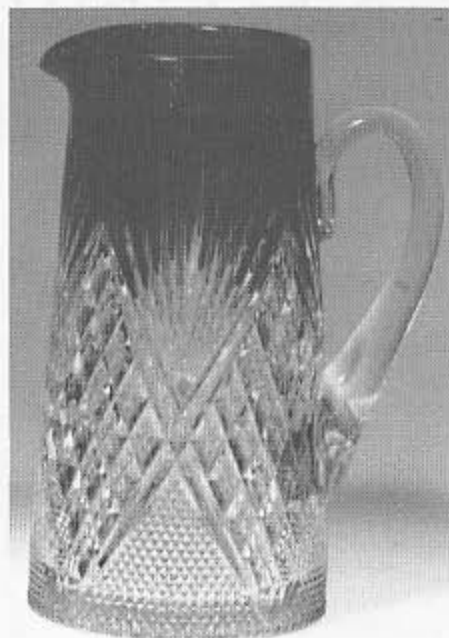
V14—TARENTUM'S VIRGINIA pattern tankard pitcher