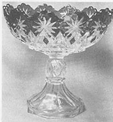
V5—U.S. Glass Co.'s VICTOR pattern high-stemmed open compote