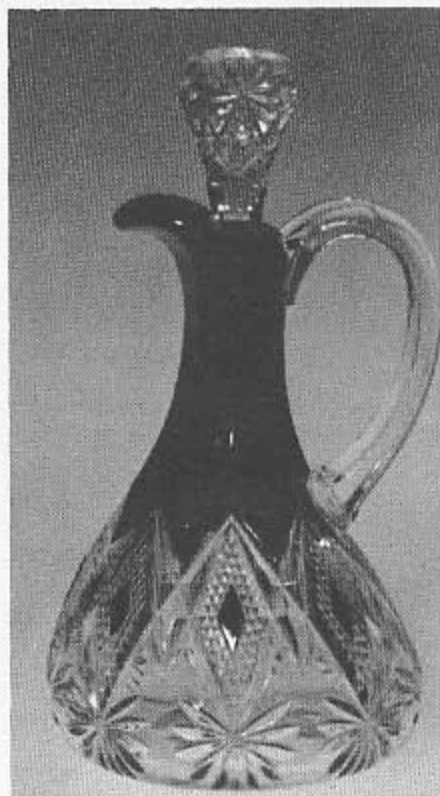
V4—U.S. Glass Co.'s VICTOR pattern cruet with original stopper (formerly endorsed SHOSHONE)

NOTE: Westmoreland copied this design in a line they called STERLING, also known in ruby-stained. There was a VICTOR pattern by Westmoreland (better known as SHELL AND JEWEL), so the company name should be used in the pattern designation.