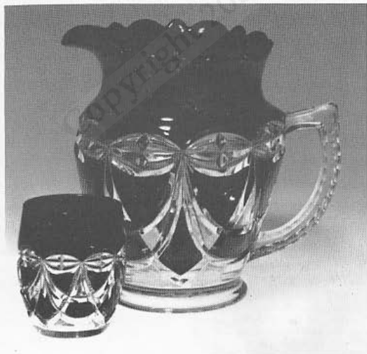
V11-V12—RIVERSIDE'S VICTORIA pattern tumbler and pitcher