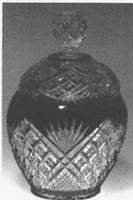
V15—TARENTUM'S VIRGINIA pattern covered sugar bowl