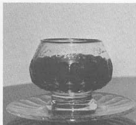
V9— Unusual covered jam dish with attached underplate in VICTORIA pattern ( lid missing)