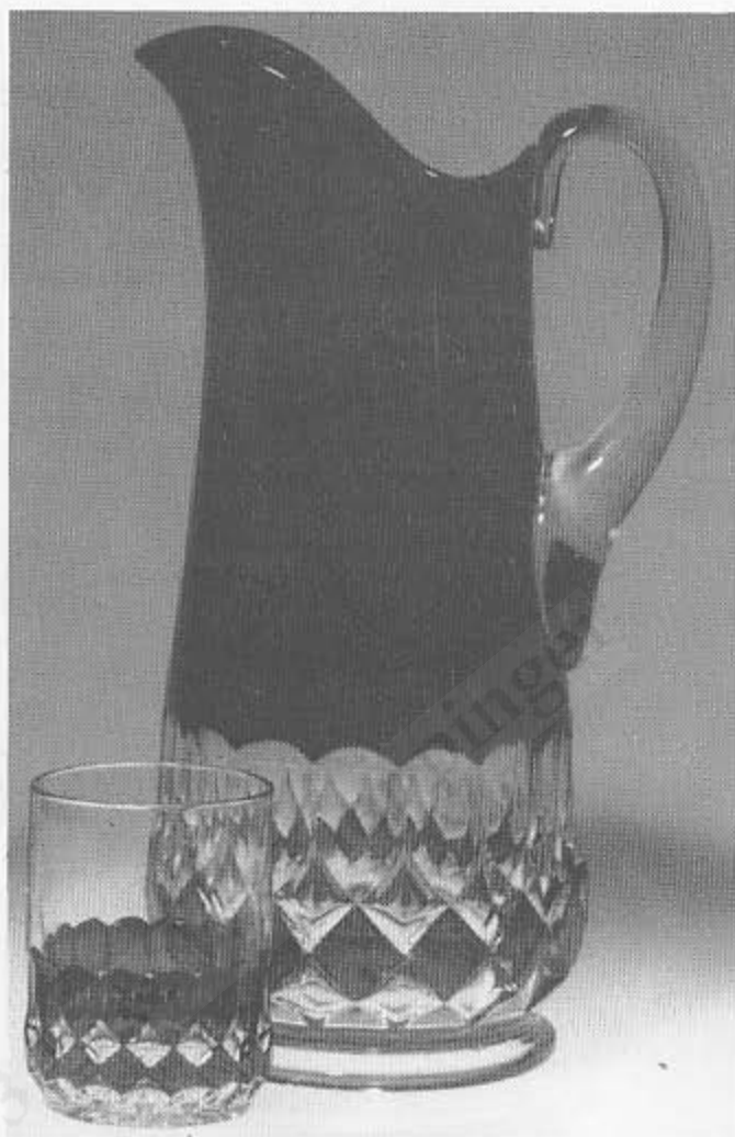
V6-V7— VICTORIA pattern tumbler and pitcher. No company name can be endorsed in the nomenclature here because so many different firms made owned the molds for this line

Among the novelties got out this season in glassware, none is more original and inviting than the Victoria spouted oil, produced by the Huntington Glass Co., of this place. It is altogether a new idea carried out to perfection and it will largely supersede the old style of oil bottles. The company have a big assortment of tableware, lamps and other specialties in crystal glass and have made much progress in the favor of the trade since they started. . . .