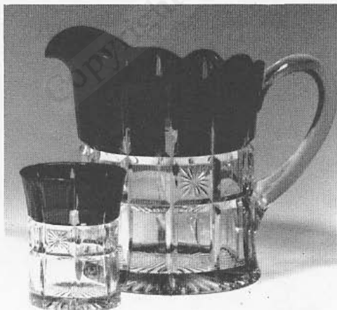
V1-V2—TARENTUM'S VERONA pattern tumbler and pitcher with solid ruby-stain around the top panels