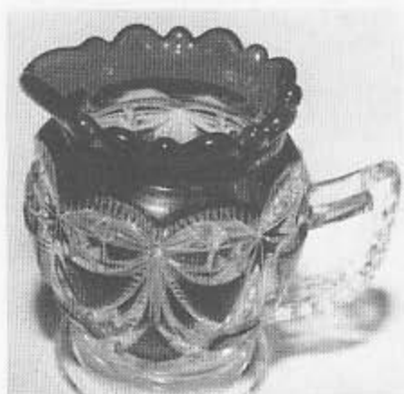
V13—Rare RIVERSIDE'S VICTORIA pattern individual size creamer. The toothpick holder probably doubled as a small individual sugar bowl for this creamer.