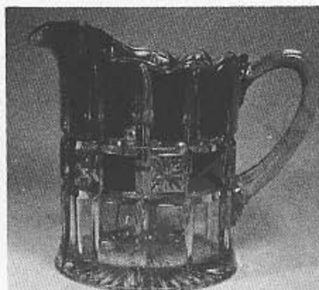
V3—TARENTUM'S VERONA water pitcher with the intermittent blocks at the center stained red and the top sections gold decorated

NOTE: There is a VERONA pattern by Fostoria ( K5 ), so the company name must accompany pattern nomenclature