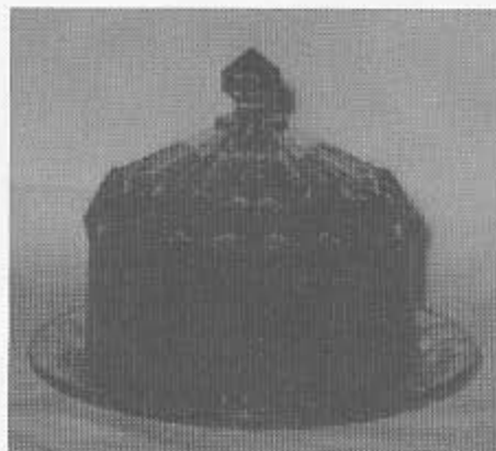
V8— VICTORIA pattern covered cheese dish