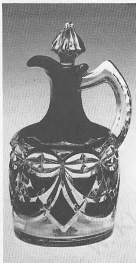
V10—RIVERSIDE'S VICTORIA pattern cruet with original stopper

A full line of everything made by the Riverside Glass Works of Wellsburg, W. Va., is shown in room 11, where all buyers will be welcomed. This enterprise make first class goods and always gets its share of the business. The new lines seem to be more popular than those brought out in former years, and this is saying a great deal. One of the new lines is No. 75. It is a plain line for engraving and in this work the Riverside is not excelled. The other new line is No. 431, known as the "Victoria", embodying a complete line of tableware, all told numbering about forty pieces. It is truly a bright figured line. They show samples of the "Victoria" in ruby-stained, also decorations on the No. 75 line in green, pink and blue. In addition to these new goods are shown samples of what they have been making the past year or two and which have sold well. No buyer should miss this exhibit.